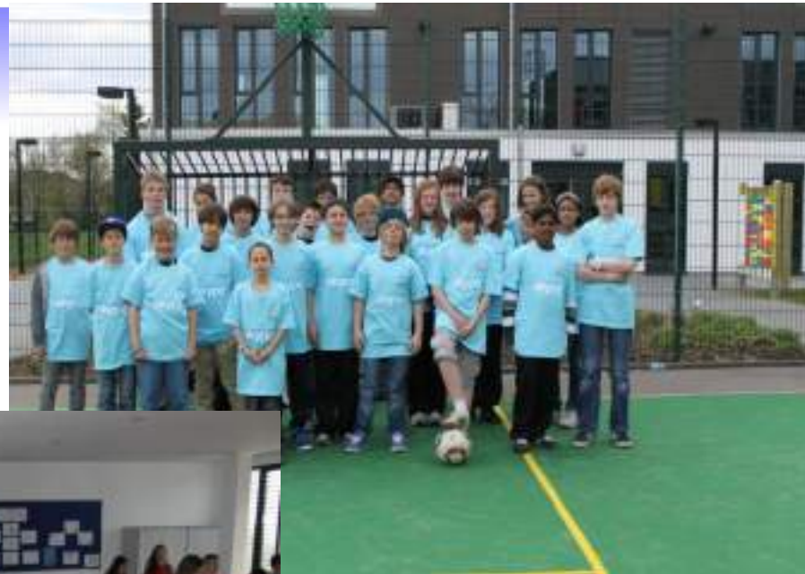
Unified Footballteam of International St.George School