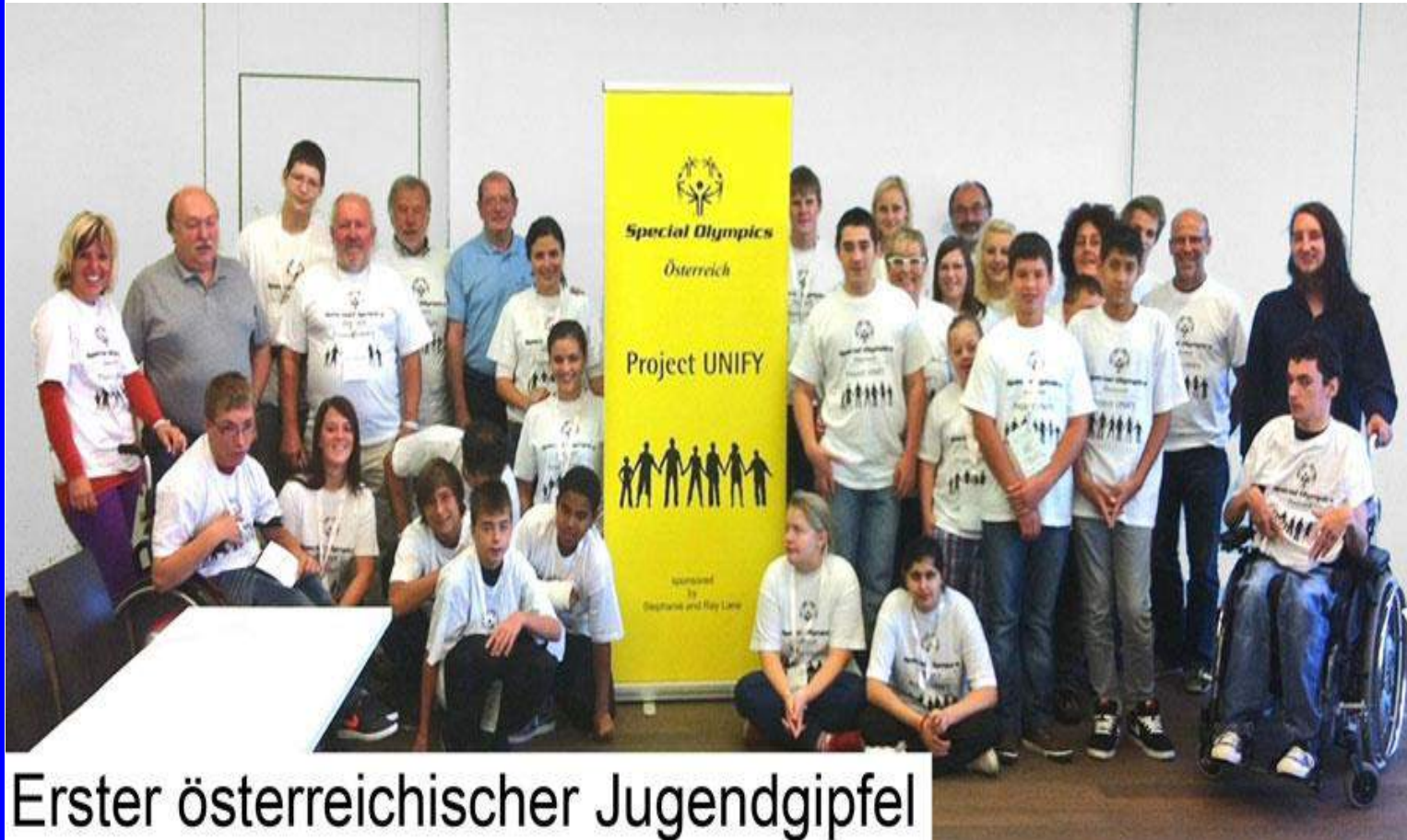
Erster österreichischer Jugendgipfel