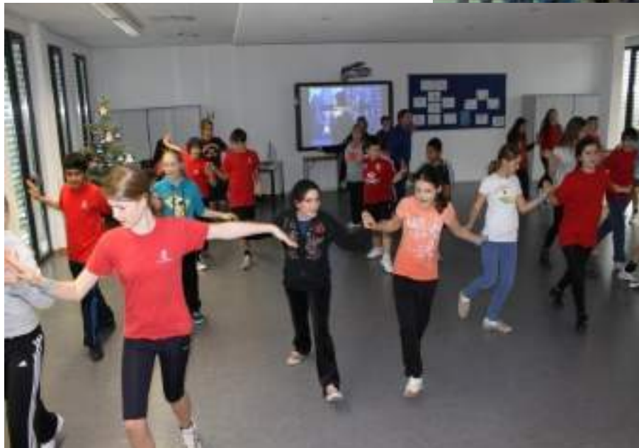
Inclusive Dancing Course (PROM 2013)